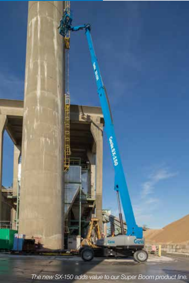
The new SX-150 adds value to our Super Boom product line.