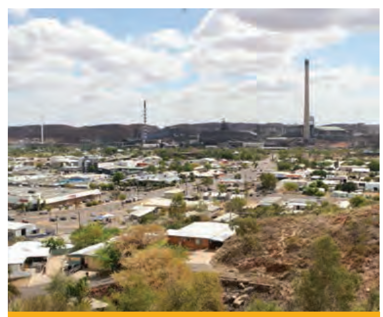
Lead was discovered in Mount Isa in 1920