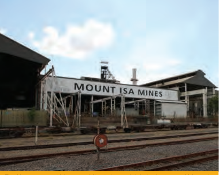
The Xstrata owned Mount Isa Mine is located right in the heart of Mount Isa

"And despite our remoteness, Genie offers fantastic sales and technical support. We complete our own maintenance but Genie assistance is on call if ever we have a problem."