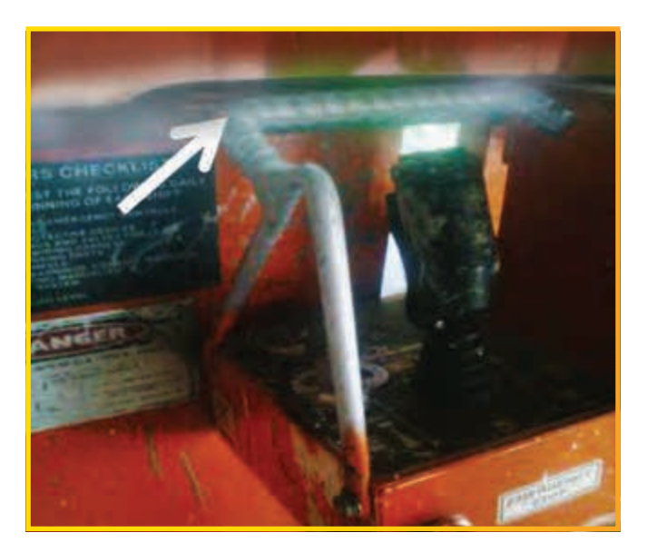
FIG1: Unauthorised 'Adhoc' guard (arrowed) welded above manufacturers original guard may cause scissor lift to become unstable if hoses, leads etc. become snagged on it.

Further, such modification(s) may constitute an alteration to the design and require a re-submission of engineering documentation from the Manufacturer as well as formal notification to the respective Workcover Authority as an alteration to Registered Plant Design.